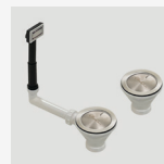
AC11 Basket Wastes with Rectangular Overflow